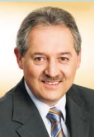
Viktor Sigl, Minister of Economy, Labour, Tourism, Sports and European Affairs, State Government of Upper Austria