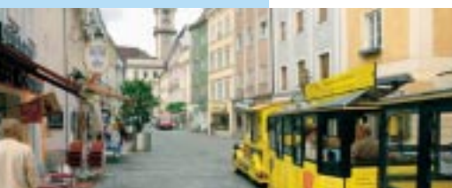
Impressions of the city Linz

Success factors of Clusterland were presented in the framework of the Upper Austrian business and political environment making it possible to put my own thinking on transferability into perspective. The Cluster Academy will be of great benefit to all cluster practitioners looking for a systematic approach of running a cluster management. Thanks to all of you at Clusterland for your enthusiasm and tremendous hospitality!"