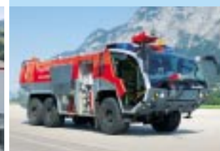
Fire fighting vehicle „Panther“