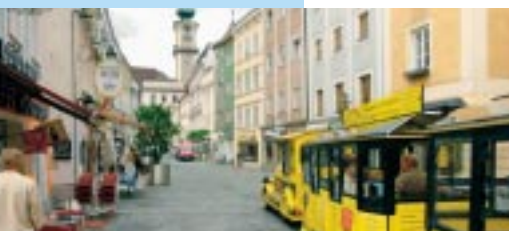
Impressions of the city Linz